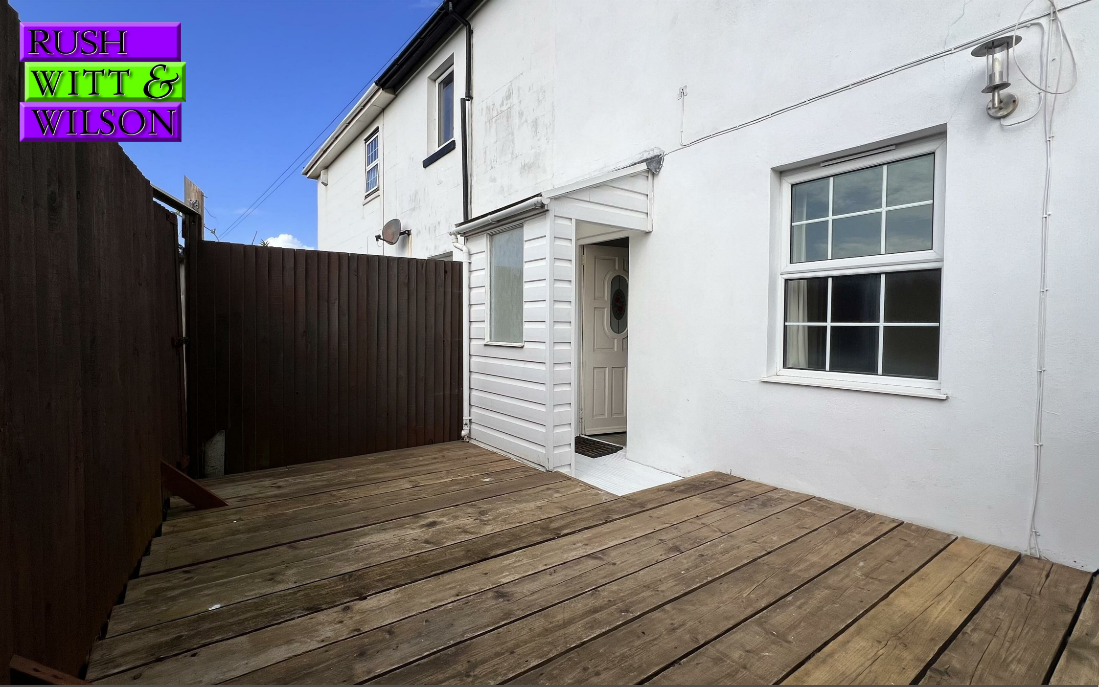
147 Railway Cottages, St. Leonards-On-Sea, TN38 0AW Guide Price £225,000 Freehold